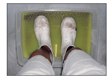
Figure 1. Mobile footbath made from a shallow container.

To help prevent the introduction of diseases, use disinfectant footbaths, hand-washing stations or alcohol spray bottles, net disinfection stations, showers, and vehicle disinfection stations. These should be placed in strategic locations (including at entrances and between systems) to make them easy to use and to maximize their effectiveness.