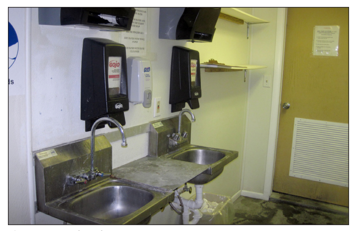
Figure 4. Hand washing station.

Hand washing. Hand washing alone with soap and water will remove a significant number of pathogens (Fig. 4). Using an antiseptic will further reduce risks. One option is a product with 60 to 90% alcohol, either straight rubbing alcohol (isopropyl), which can be applied with a spray bottle, or a gel product. Alcohol can dry the skin. Antibacterial soaps may also provide some level of protection, but be aware of any additives such as perfumes that might be toxic in the water.