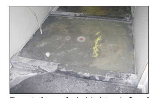
Figure 3. Concrete footbath built into the floor of the hallway.