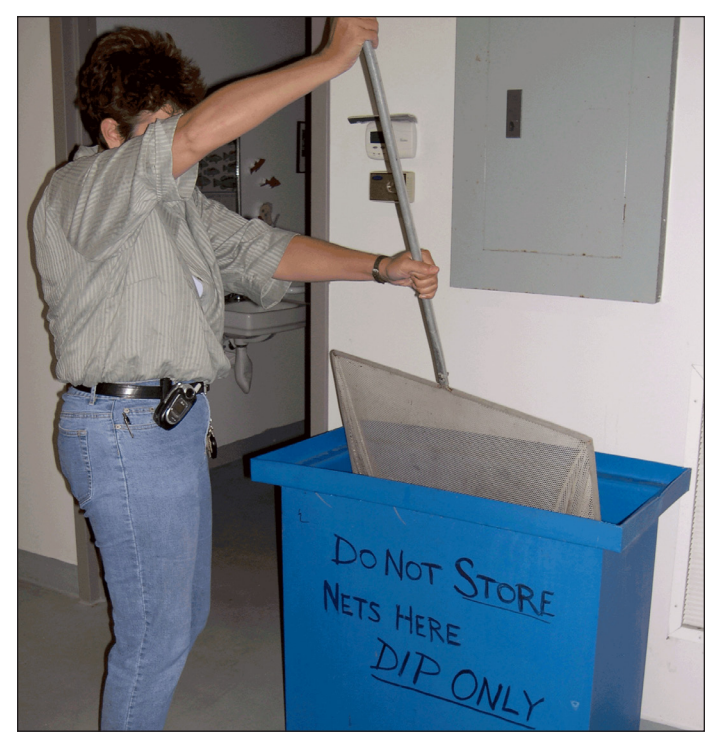
Figure 5. Net disinfection station.

Net disinfection stations (net dips). Nets should be disinfected after use to prevent the spread of pathogens from one group of fish to another. Net dips should be sized and filled to allow complete submersion of the net and, if possible, the portion of the handle that may be submerged during use (Fig. 5). Stations should be strategi-