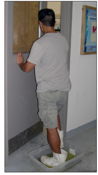
Figure 2. Footbath placed at the entrance to a room.

chlorite) are commonly used, but chlorine is harsh on many materials. Virkon® Aquatic diluted according to instructions is considerably safer than chlorine products.