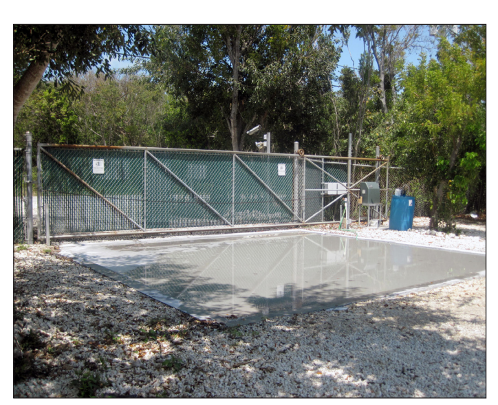
Figure 6. A drive-through disinfection area, consisting of a shallow area filled with disinfectant, to disinfect vehicle wheels.

Vehicle disinfection stations. Vehicles that travel from one facility to another may transport pathogens on their wheels. Having drive-through areas filled with disinfectant at entrances and exits can help reduce this risk (Fig. 6). If a facility is known or suspected to have an outbreak of an important disease, scrubbing stations, where vehicles can be scrubbed more thoroughly with brushes and disinfectant, may be necessary.